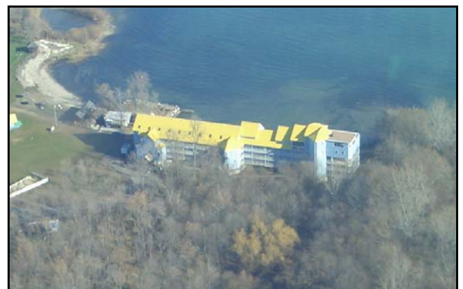
Aerial view of complex on eastern shore of Middle Bass Island; our unit is on the third floor for the best views on Middle Bass!

Call Jeff for more details and to schedule a visit: 614-271-8525