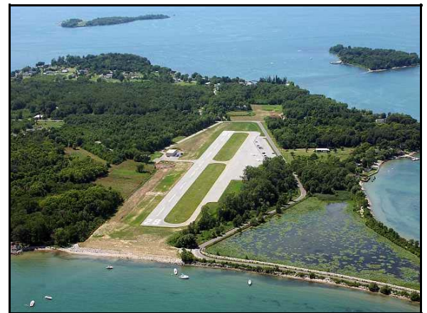
New 1852' asphalt runway, 2001—Seasonal tie-downs available